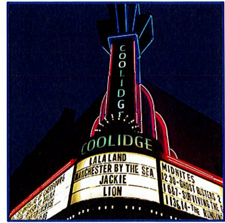
Coolidge Corner Theater

This is a receiver worn casually on your hip or held in the hand. It also can come with a lanyard that acts as an induction loop. The Coolidge has reduced the size and improved the sound quality of the device and headphones (or neck-loop). Nick has also added two in-house microphones in the larger movie houses, one and two, so that live movie introductions and post-show discussions are more audible and now run through the system into the devices.